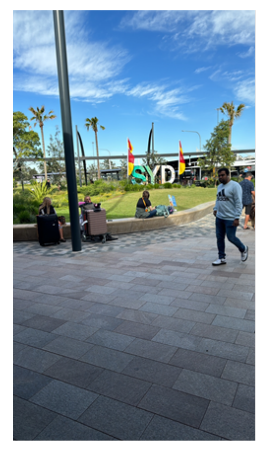
As you can see: I fly now to most interesting places!

https://www.flightglobal.com/aerospace/court-orders-liquidation-of-french-light-aircraft-manufacturer-robin/155961.article